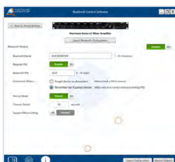
Bluetooth Control Software