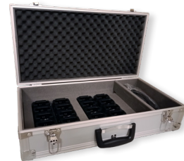
CB-20X 20-slot charging case