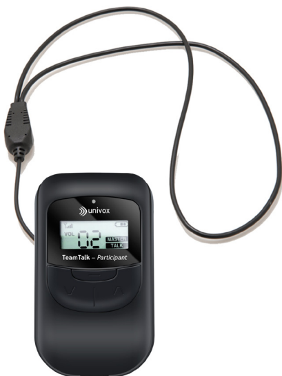
TeamTalk-P with NL-90 Neckloop