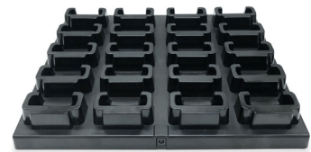
CS-20X 20-slot charger station

For complete manual, please refer to univox.eu .