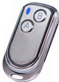
W-1 Wireless Transmitter

Wireless remote control system W-1 consists of a transmitter equipped with two buttons to activate, deactivate and an onboard receiver attached to the rear panel of AG-1500.