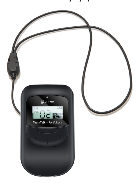
TeamTalk-P with NL-90 Neckloop